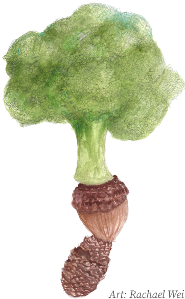
Art: Rachael Wei

(Divis Farmers Market: Sundays from 9am - 1pm in the DMV parking lot on Fell/Oak - open yearround!)